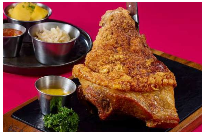
German pork knuckle

German-style pork knuckle with sauerkraut, mustard, seafood sauce, and potato salad.