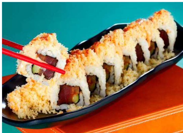
Spicy Tuna Crunch Roll