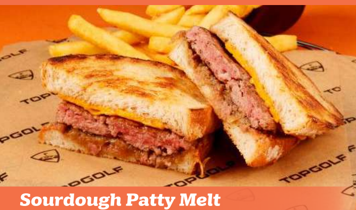
Sourdough Patty Melt

Beef and caramelized onions, American cheese, sourdough loaf and your choice of fries or crisps