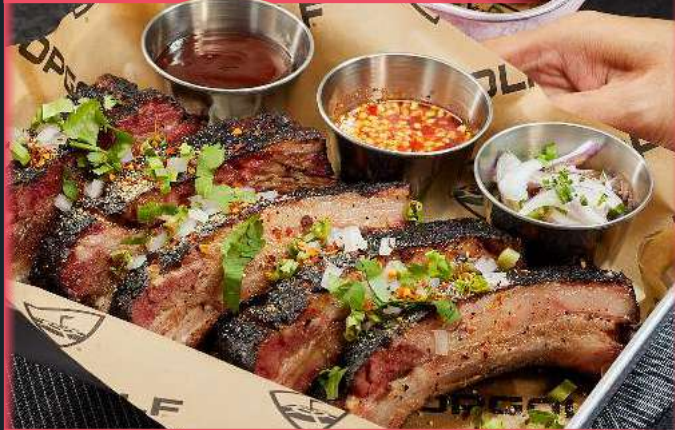
Thai pepper dry rub