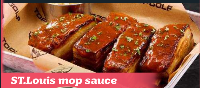
ST. Louis mop sauce

ซีโรงหมูรมควันโรยผงพริกและสมุนไพร เครื่องเทศแบบไทย