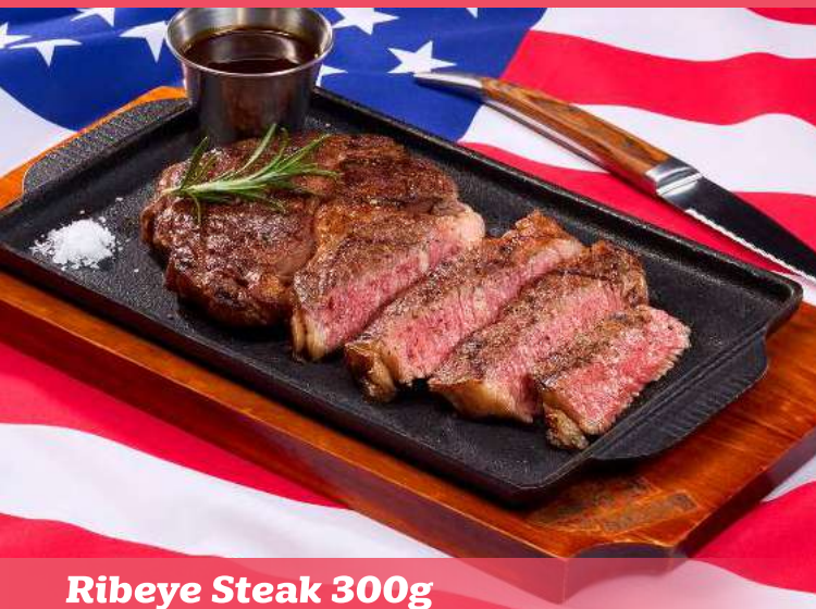
Ribeye Steak 300g